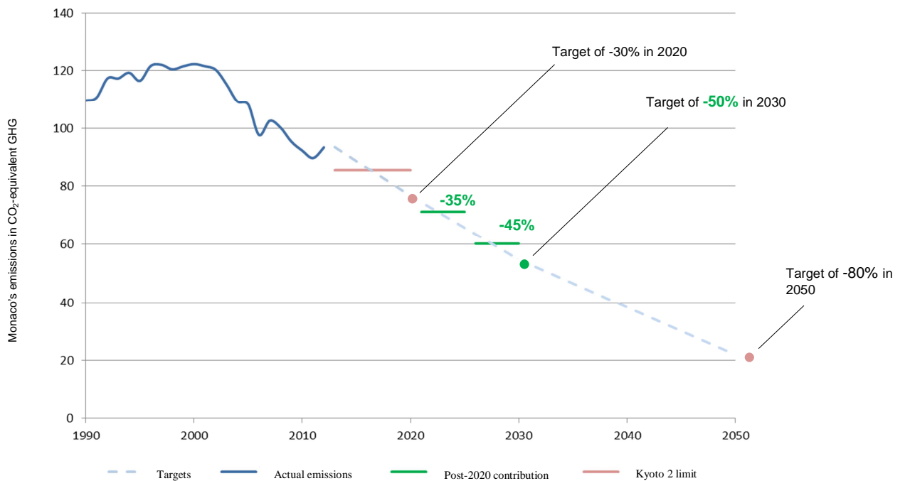
Figure 2: Graph showing the Principality of Monaco's reduction target assuming two commitment periods of five years each